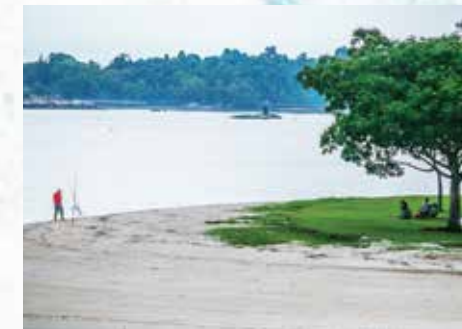
The splendid view of Changi Beach Park from the Clubhouse.