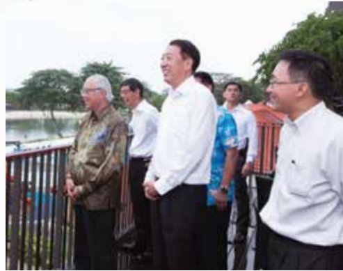
The two VIPs enjoyed the view from the Family Suite.