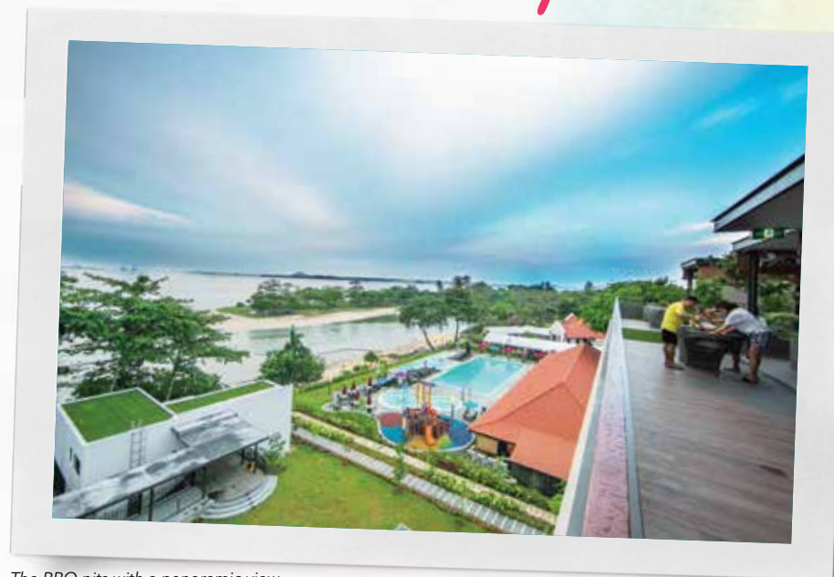
The BBQ pits with a panoramic view.

And CSC@Changi, with its five-storey sports complex, well-furnished chalet suites and villas, is a home away from home for Singapore's civil servants. The Clubhouse complements its vast space with an all-encompassing array of facilities and meaningful social activities.