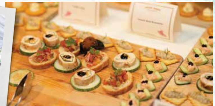
Guests savouring the wonderful spread of food from Meyer House Restaurant & Bar.