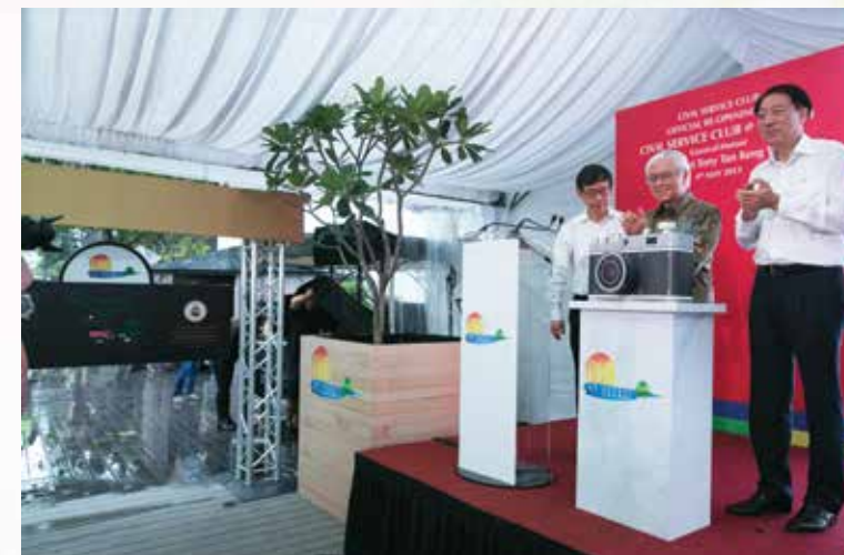
The unveiling of the plaque marks the reopening of CSC@Changi.