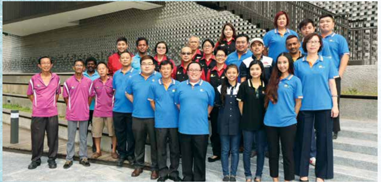
The staff who make your visit an unforgettable experience.

The staff of CSC@ The staff of CSC@Changi welcome you! CSC@Changi we