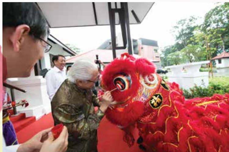
President Dr Tony Tan dotting the lion's eye, symbolising an auspicious start for the Clubhouse.