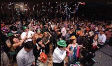
In a party mood, with funky hats, confetti, cheers!

We would like to thank our generous sponsors for their support.