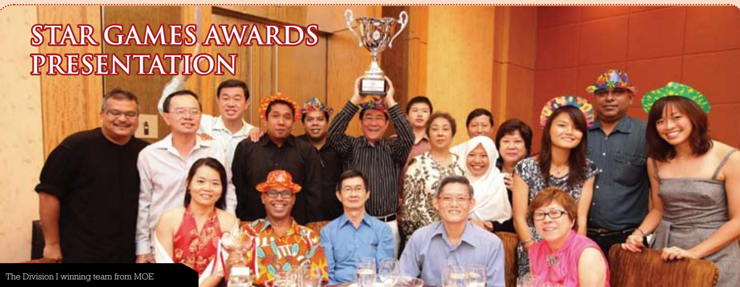
The Division I winning team from MOE