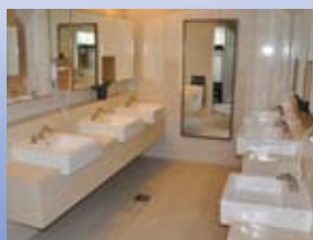
Newly renovated toilets and more!