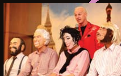
Pavarotti, the Queen and Michael Jackson were also at the DnD!