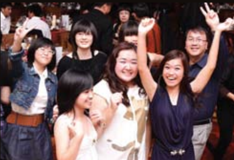
Showcasing our hip young members