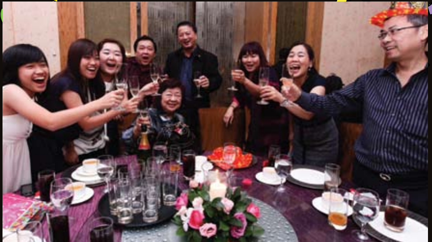
A toast to usher in 2011!