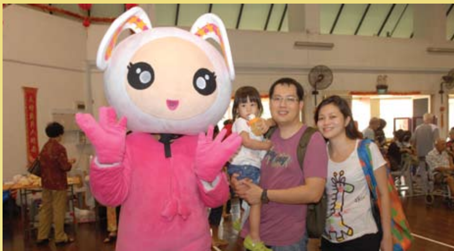
Happy Year of the Rabbit!