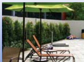
New poolside deck chairs and umbrellas

Thursday 17 March & Thursday 21 April 2011 @ 7.30 pm Tessensohn Ballroom 4 th Floor Super Jackpot Prize of $5000 , Full House/Line Prizes and Lucky Draw