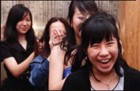
Smiles and laughter all around