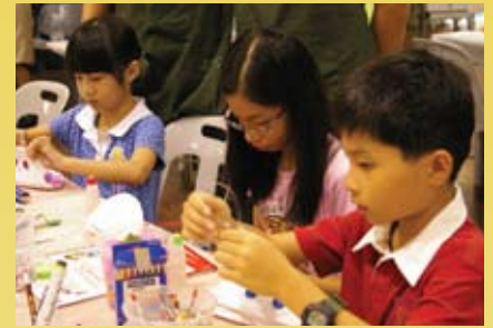
Children making angbao decorations