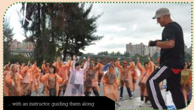
... with an instructor guiding them along