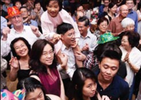
Members old and young celebrate together