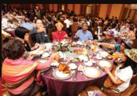
Settling in for the dinner