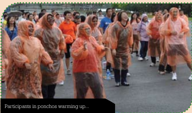
Participants in ponchos warming up...