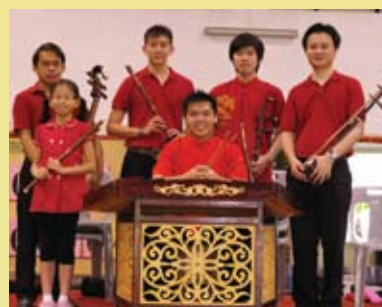
Chinese orchestra by Eason Music