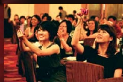
All eyes on the programme on stage