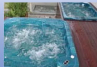
Newly installed hot jacuzzis await