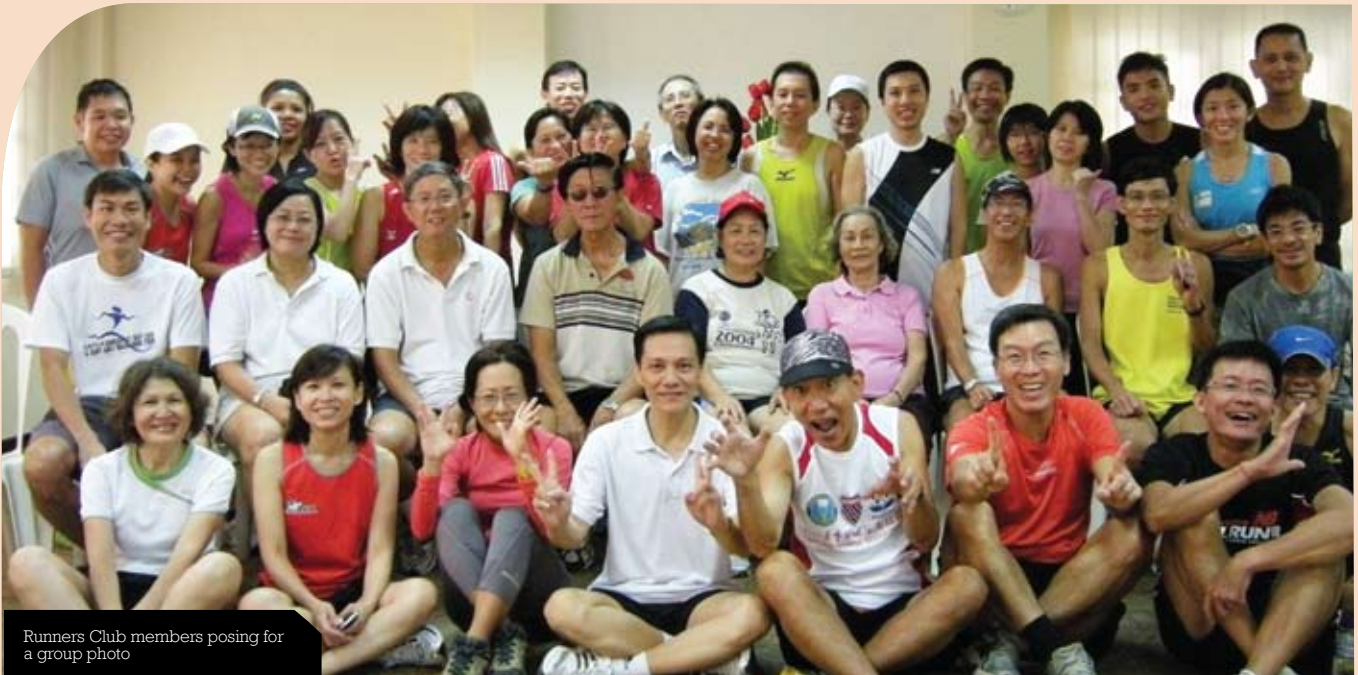
Runners Club members posing for a group photo