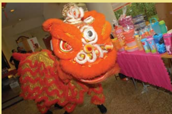
A lion dance opened the bazaar

On Saturday, 15 January 2011, CSC Club @ Tessensohn hosted a Chinese New Year bazaar for members to celebrate the arrival of the Year of the Rabbit. From 10am in the morning the club was full of festivities, with members enjoying an exhilarating Lion Dance performance that opened the bazaar. There were more than 40 stalls selling all sorts of goodies, from biscuits, to fresh fruits, to traditional snacks and much, much more! Children were treated to an art and craft session where they could make muppets, angbao décor and clay figurines. They also had the chance to play Money Champ board games and the Sentosa 4D Max online game.