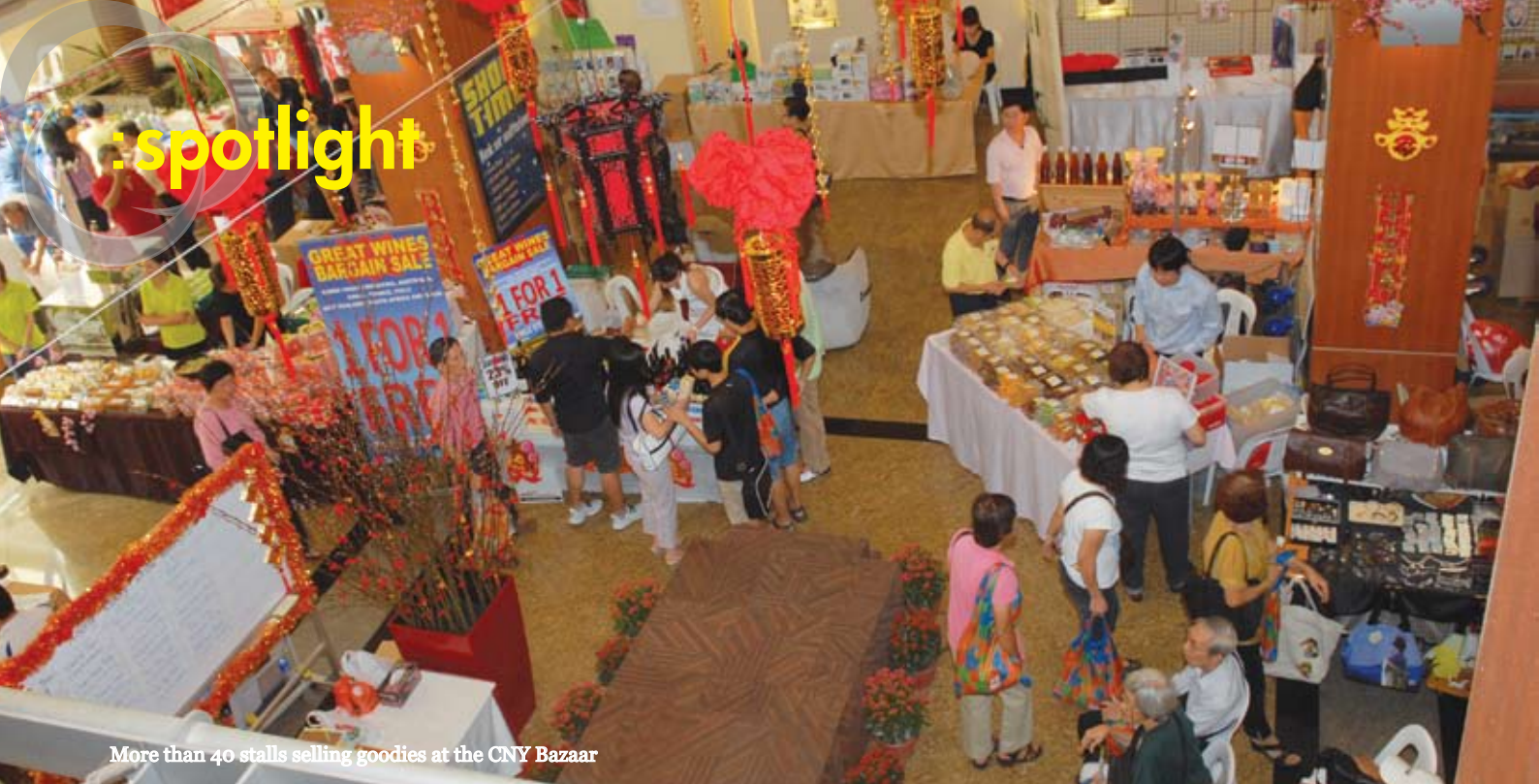
More than 40 stalls selling goodies at the CNY Bazaar