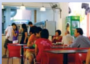
Come makan at Simply Peranakan!