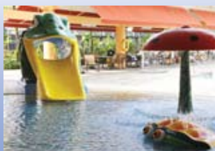
The Children's Pool with new water play features