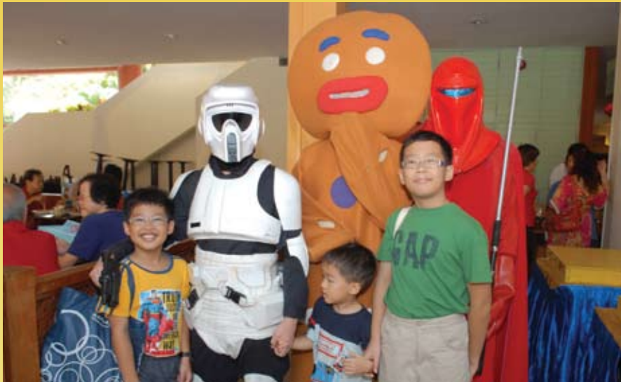
Children having fun at the bazaar